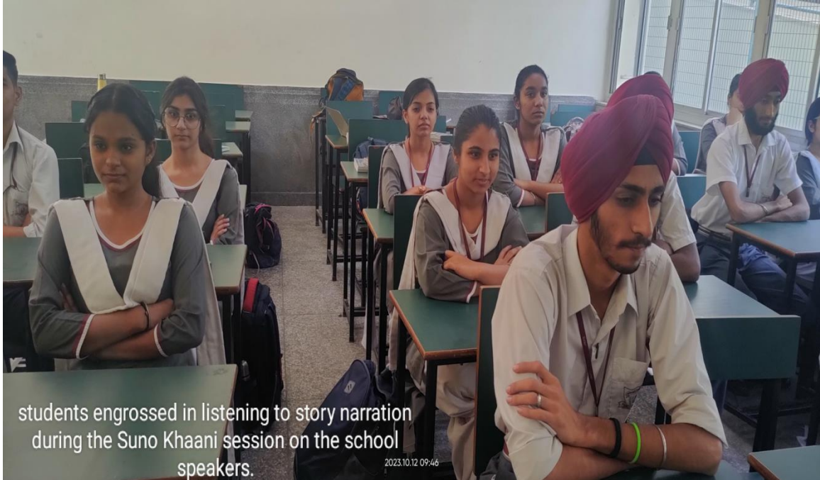
students engrossed in listening to story narration during the Suno Khaani session on the school speakers.