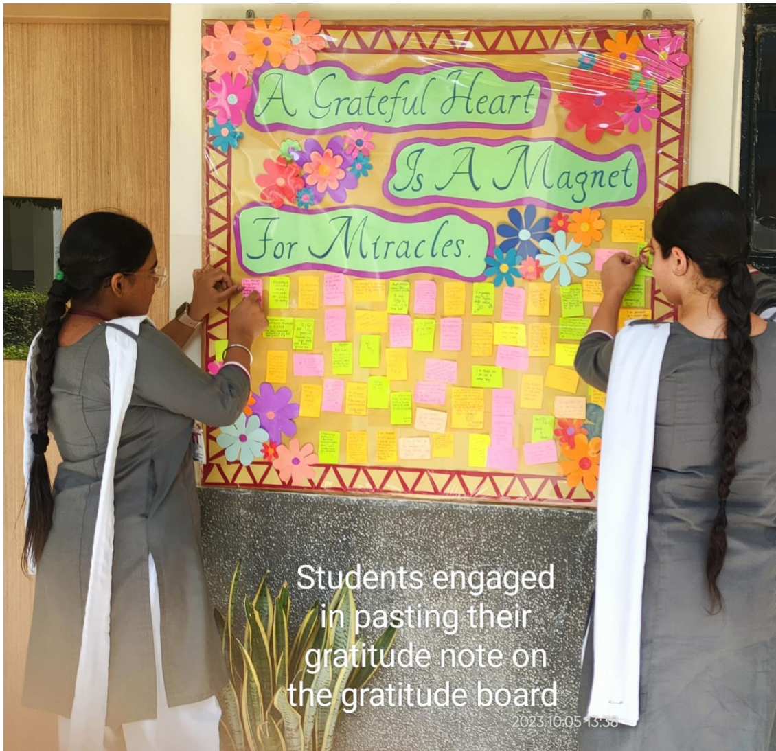
Students engaged in pasting their gratitude note on the gratitude board